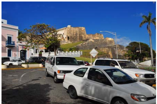
Old San Juan Fort & Traffic