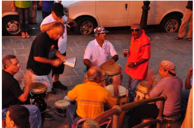
Sidewalk Jazz Drum Group