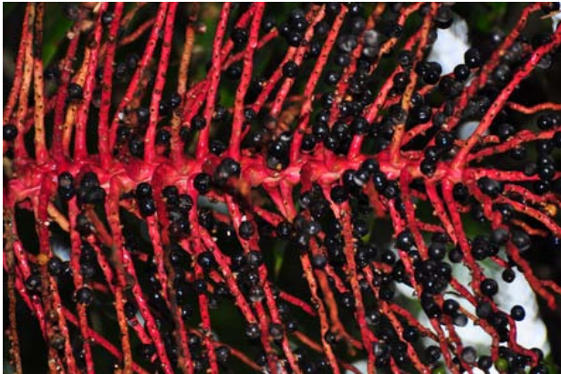
Palm tree seeds up close