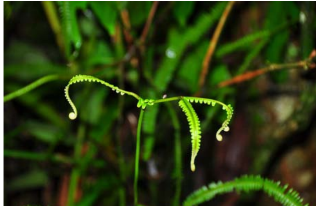
A Few fresh fern Fiddleheads