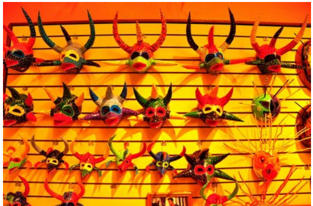
Mardi Gras Masks to Scare Evil Spirits