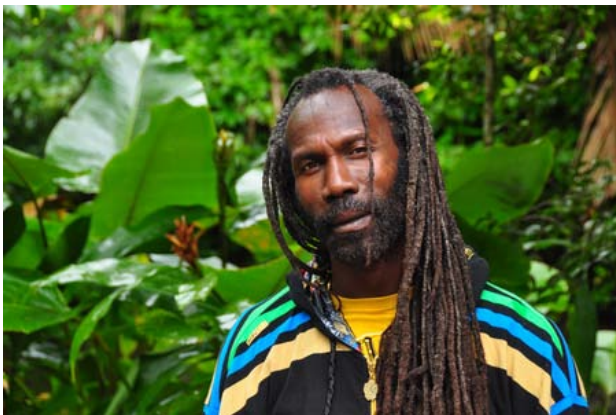
Reggae Musician Touring Rainforest