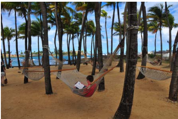
Relaxing in the Palms