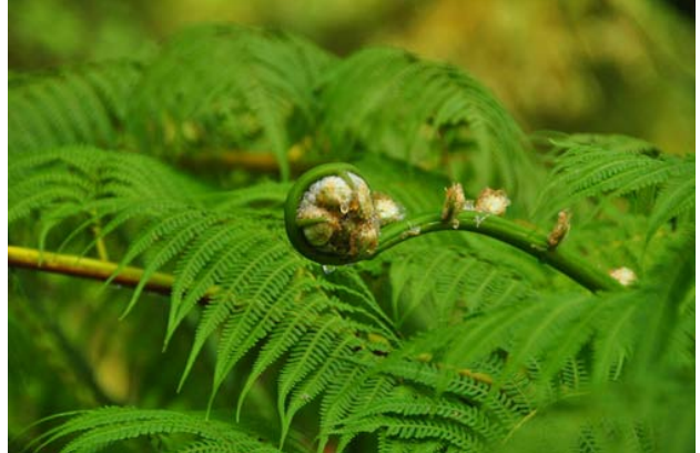
Fern Fiddleheads in Rainforest