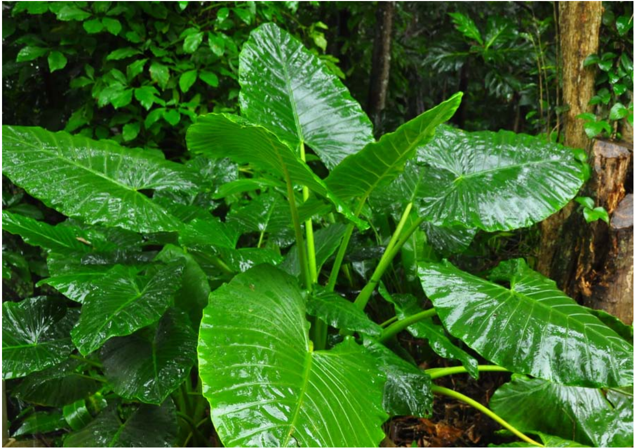
Giant Elephant Ears Plant in Raining Rainforest fa