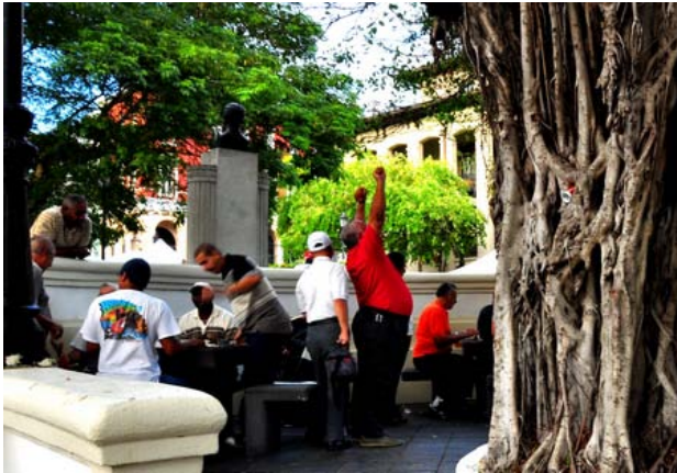
Street Chess Playing in the Plaza